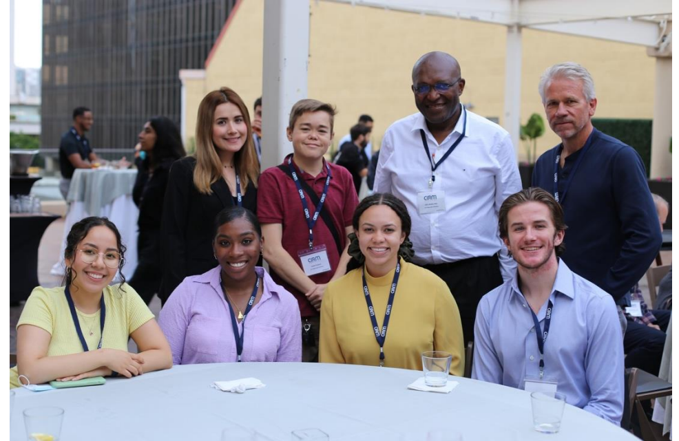
2022 CIRM Bridges Conference San Diego, CA